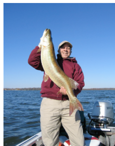
...and 40" muskie